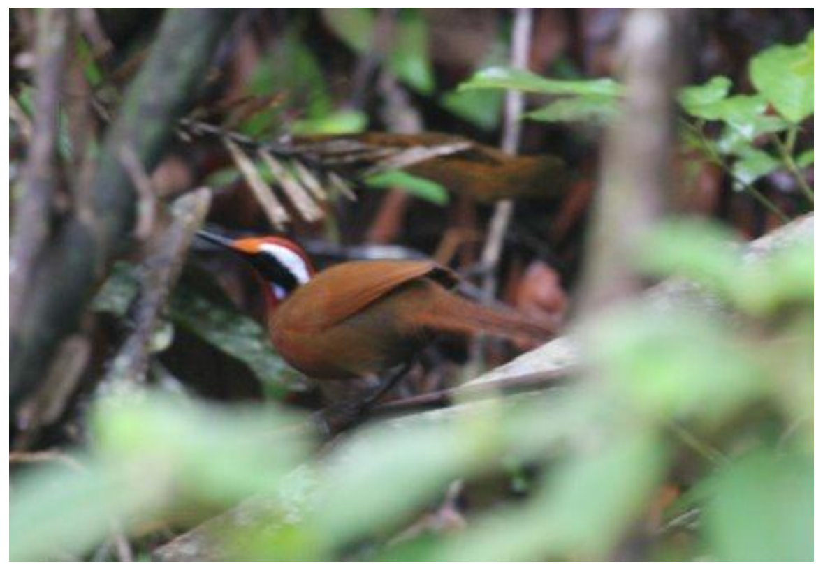
Rail Babbler Eupetes macrocerus at Panti Forest Reserve - seen at last!

Around 7.00 am, we got past the swamp after locating two Black Magpies and saw several Common Emerald Doves walking on the trail near the shrine. Suddenly, we heard that distinctive monotone whistle yet again just off trail, close to the shrine. Our hearts pumping furiously, we positioned ourselves. What followed was simply unbelievable! The Rail Babbler ran across the track and into the forest on the other side. We waited and then heard the bird call again. CC played a short burst from his ipod and we only had to wait a few minutes before it showed itself on an exposed branch, in clear view, just ten metres from us. It called and then proceeded to perform a courtship display, first bowing to the left and then to the right. It performed in this manner, oblivious of the excitement it was causing to the human observers, for over 15 minutes! After getting record shots, we left the Rail Babbler, still displaying, and gave each other, hi-fives. Mission accomplished!