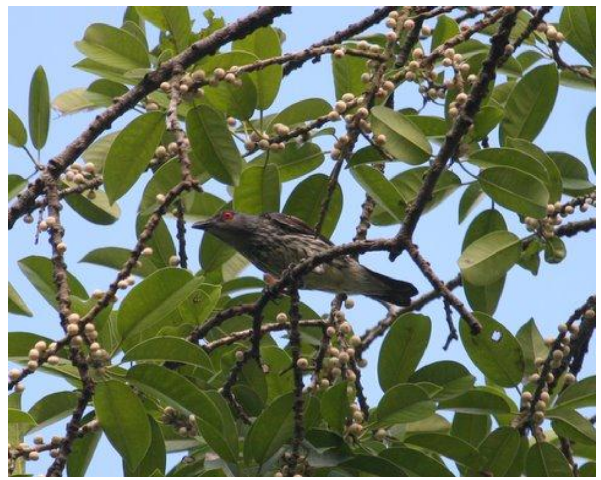
Asian Glossy Starling Aplonis panayensis at Botanic Gardens, Singapore.

not with us however, for we found the tree in fruit with lots of Asian Glossy Starlings, Coppersmith Barbet and Pink-necked Green Pigeons but no owl.