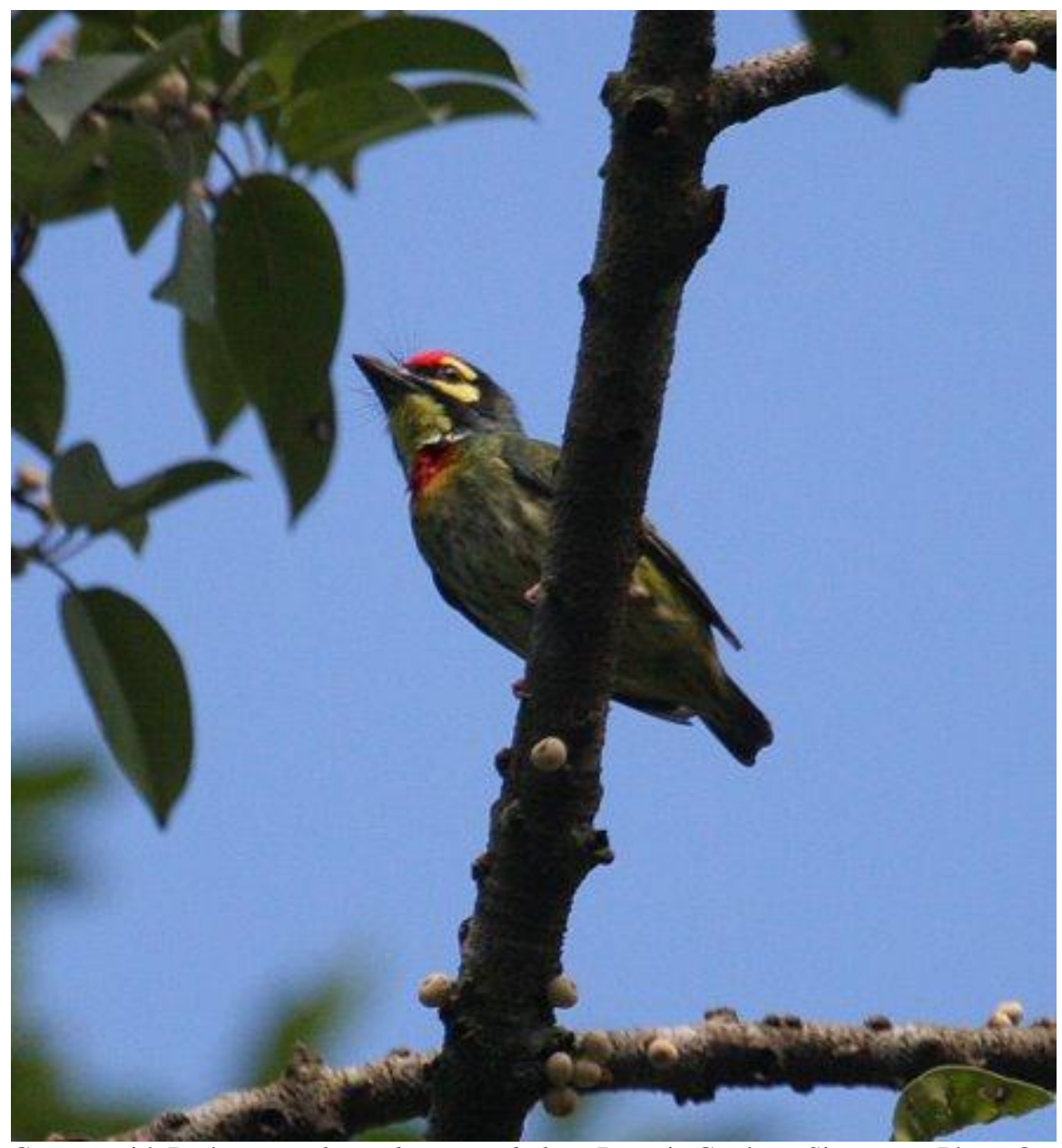
Coppersmith Barbet Megalaima haemacephala at Botanic Gardens, Singapore.

It was a very successful trip. Three days and 145 species including our major target of Rail Babbler despite the late season and rainy weather. Other highights included Whitebellied Woodpecker, Wrinkled Hornbill, Rufous-collared Kingfisher, Scarlet-rumped trogon, Red-bearded Bee-eater, Malaysian Hawk Cuckoo, Jambu Fruit Dove, Cinnamonheaded Green Pigeon, Buffy Fish Owl, Black Magpie, Black-capped Babbler and Whitebellied Erphonis.