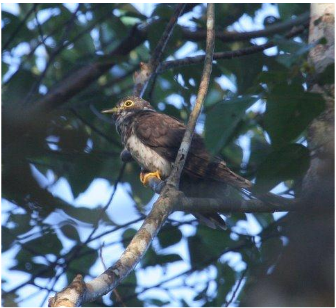
Malaysian Hawk Cuckoo Hierococcyx fugax at Panti Forest Reserve.

Moving deeper into the temple trail, we saw a flock of Little Green Pigeons feeding in a fruiting tree and located several juveniles. We also had good views of several Dusky Broadbills and the colourful Yellow-bellied Bulbul here.