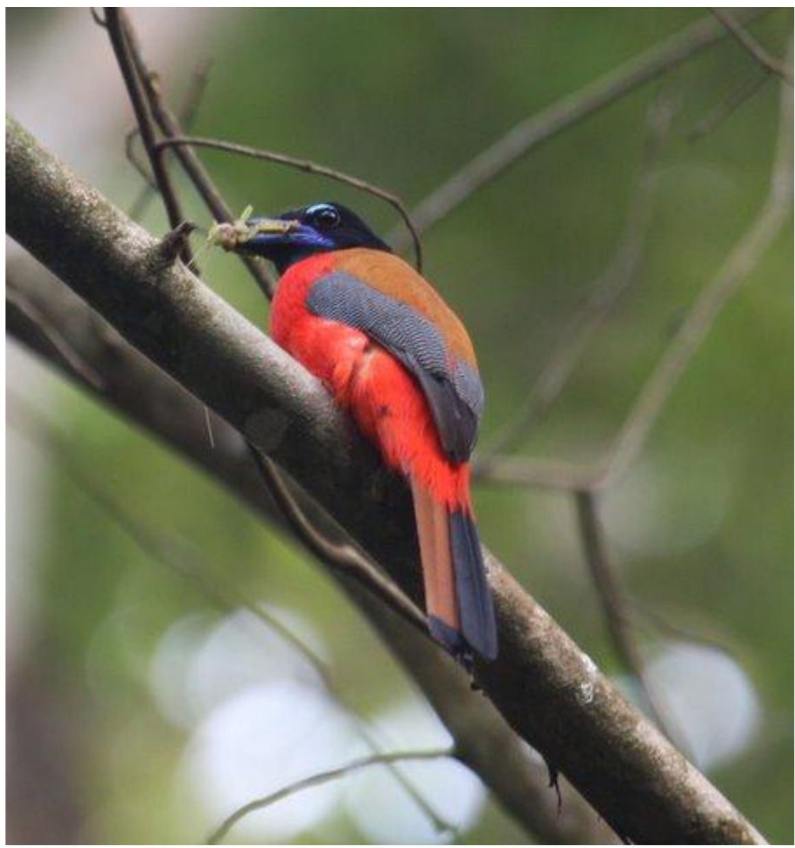
Male Scarlet-rumped Trogon Harpactes duvaucelii at Panti Forest Reserve.

Moving past the swamp to the shrine, we found a superb male Jambu Fruit Dove, four Grey-and-buff Woodpeckers, a stunning male Scarlet-rumped Trogon, White-crowned Forktail and more bulbuls.