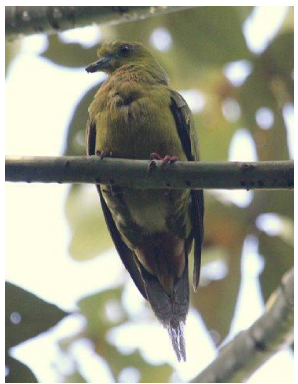
Juvenile Little Green Pigeon Treron olax at Panti Forest Reserve.

Eventually, we decided to say goodbye to Panti Forest Reserve and her amazing birds at 12.30 pm and return to Singapore. Along the way, we met a couple of irate Singaporean bird photographers who were stopped by rangers asking for permits. We saw a ranger at his sentry post, gave him a friendly smile and then drove on without any incident.