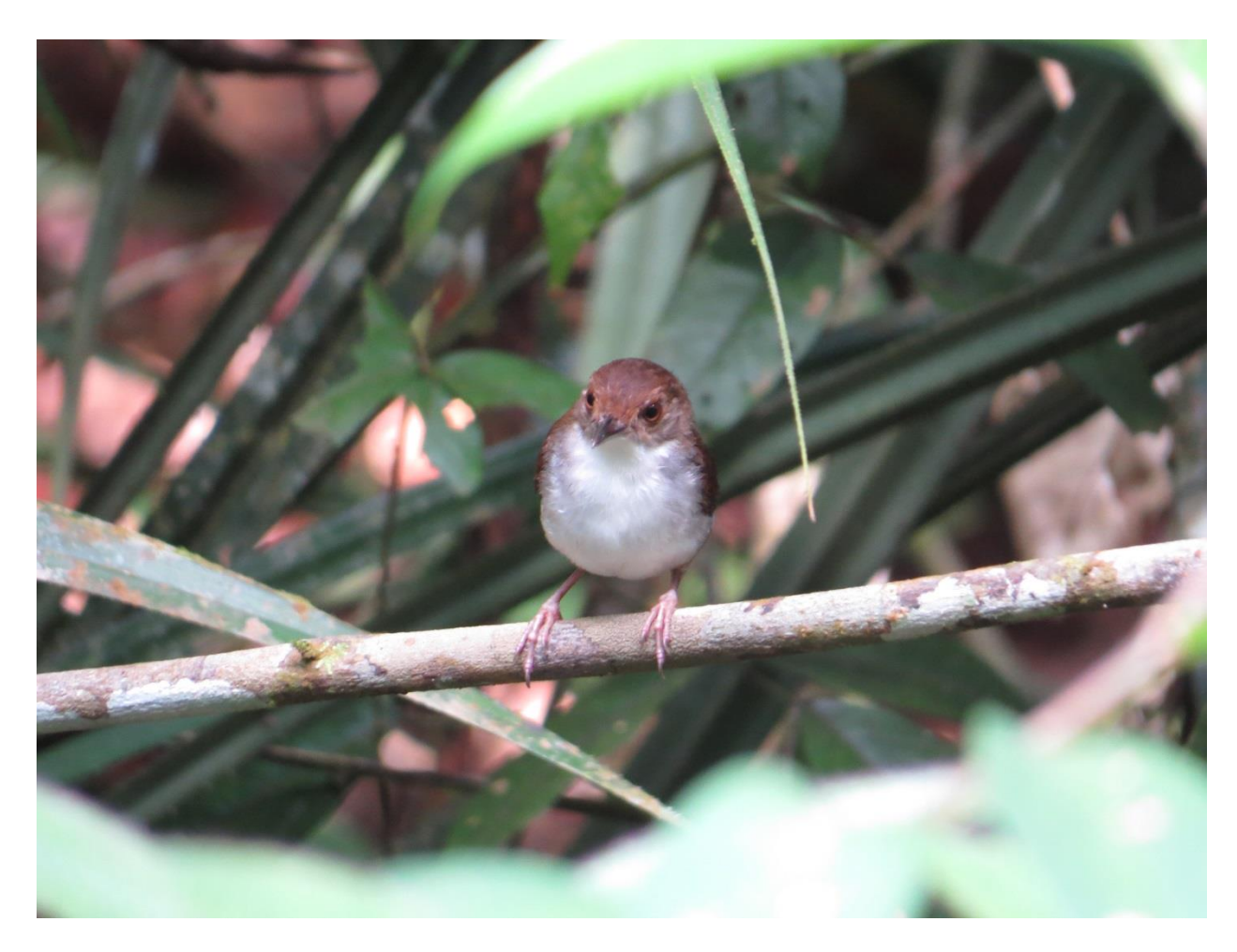
A friendly White-chested Babbler at Panti.