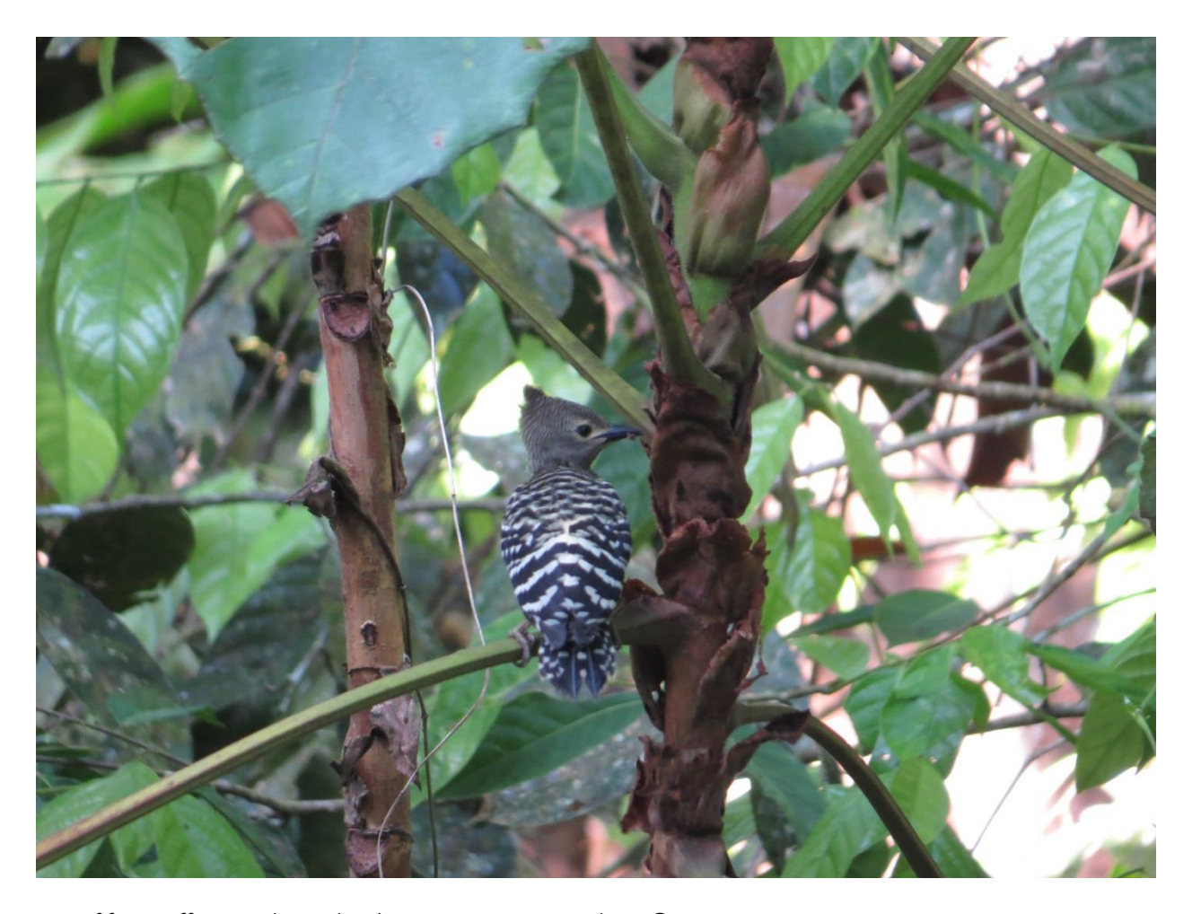
One of four Buff-rumped Woodpeckers we saw at Panti.

We also explored the shrine and the temple trail and saw White-chested Babbler, Black-naped Monarch and Rufous-tailed Tailorbird to add to our growing list. The trogons and broadbills were however not cooperative and we didn't see them. We did see four different flowerpeckers and five species of sunbirds, so it wasn't a bad day.