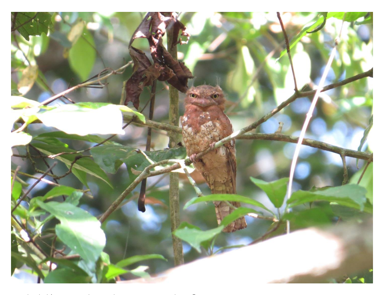
A male Blyth's Frogmouth at its day roost at Panti. Photo © Lim Kim Seng

Text & Photos by Lim Kim Seng (<a href="mailto:ibisbill@yahoo.com">ibisbill@yahoo.com</a>)