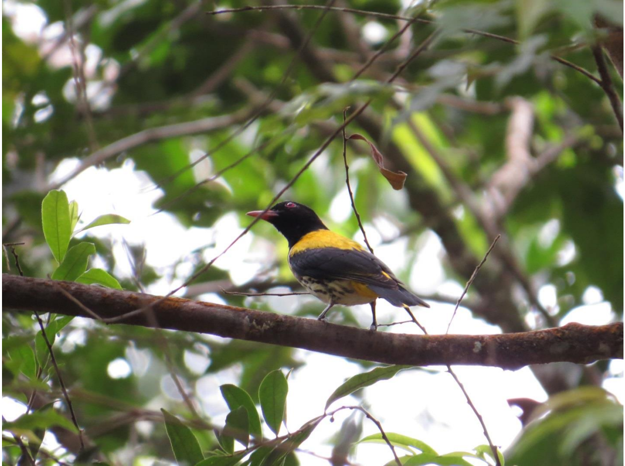
The attractive male dark-throated Oriole at Pantí Bird Sanctuary. Photo © Lim Kim Seng

Text and Photos by Lim Kim Seng ( ibisbill@yahoo.com )