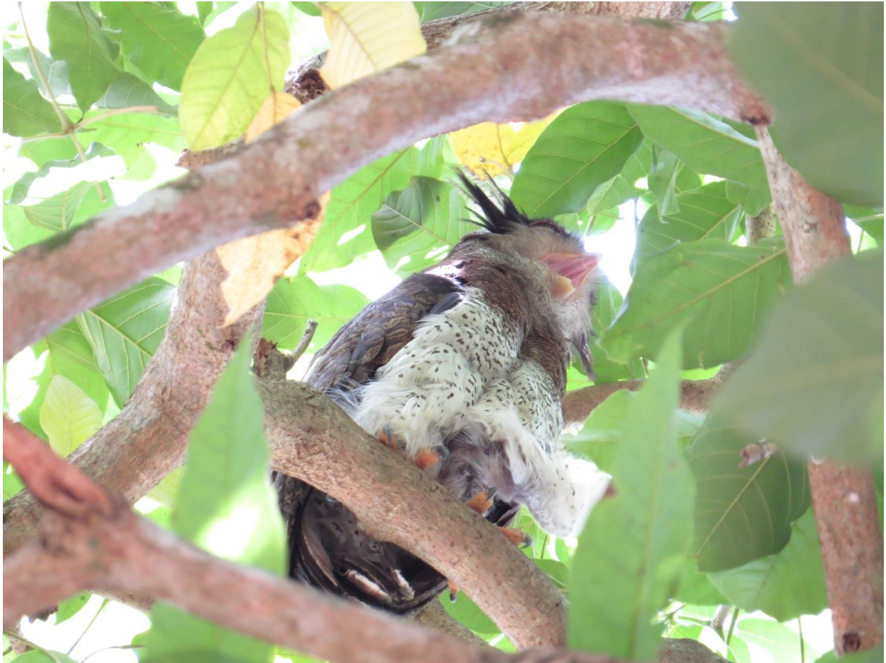
Barred Eagle Owl in Johor.

throated Woodpecker, a male Diard's Trogon, Chestnut-bellied Malkoha, a white male Asian Paradise-flycatcher with a long tail and several bulbuls.