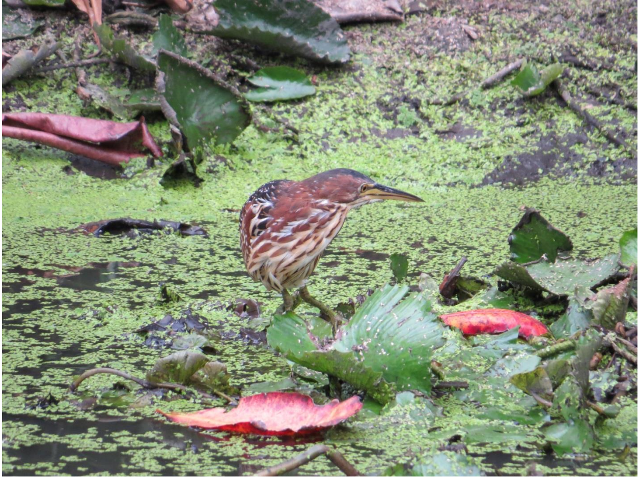
Female Von Schrenck's Bittern at Sungei Buloh.

Lunch was next followed by a long drive to Pasir Ris Park. Our target was the resident Spotted Wood Owls and we found them easily. There was still time for a short hop over to Lorong Halus Wetland where we managed to add Black Baza, Chinese and Javan Pond Herons in partial summer plumages, Slaty-breasted Rail and White Wagtail.