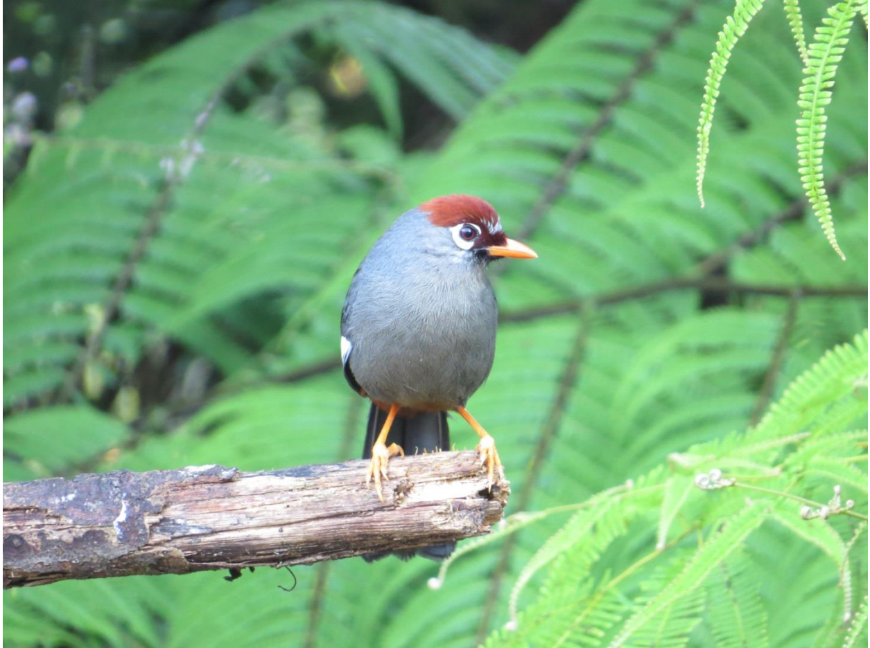
The charming Chestnut-capped Laughingthrush at Fraser's Hill.

Up at Fraser's Hill, we had a quick lunch and continued birding in the area around Telecoms Loop and the loop around the golf course. It was generally quiet but we added Greater Yellownape and Asian House Martin to achieve a day tally of 73 species.