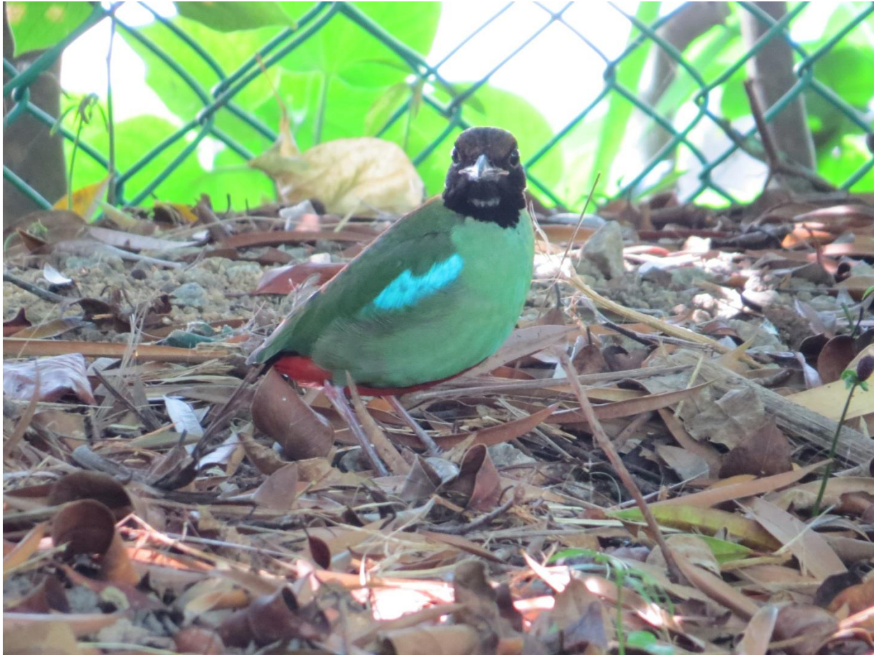
Hooded Pitta at Singapore Botanic Gardens.

Barbets, a perched male Blue-rumped Parrot, a surprise Straw-headed Bulbul, Short-tailed Babbler and van Hasselt's Sunbird.