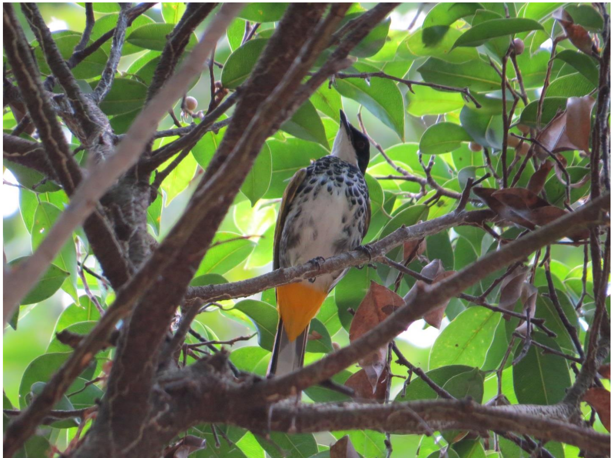
Scaly-breasted Bulbul at a fig tree at Taman Negara.

Days Twelve and Thirteen were also long hard days of birding in the majestic lowland forests of Taman Negara. Highlights included Crested Partridge, Crested Fireback, Red-naped and Cinnamon-rumped Trogons, White-crowned Hornbill, Blue-banded Kingfisher, Scaly-breasted Bulbul, Ferruginous Babbler, Rufous-chested Flycatcher, Malaysian Blue Flycatcher and Scarlet-breasted Flowerpecker.