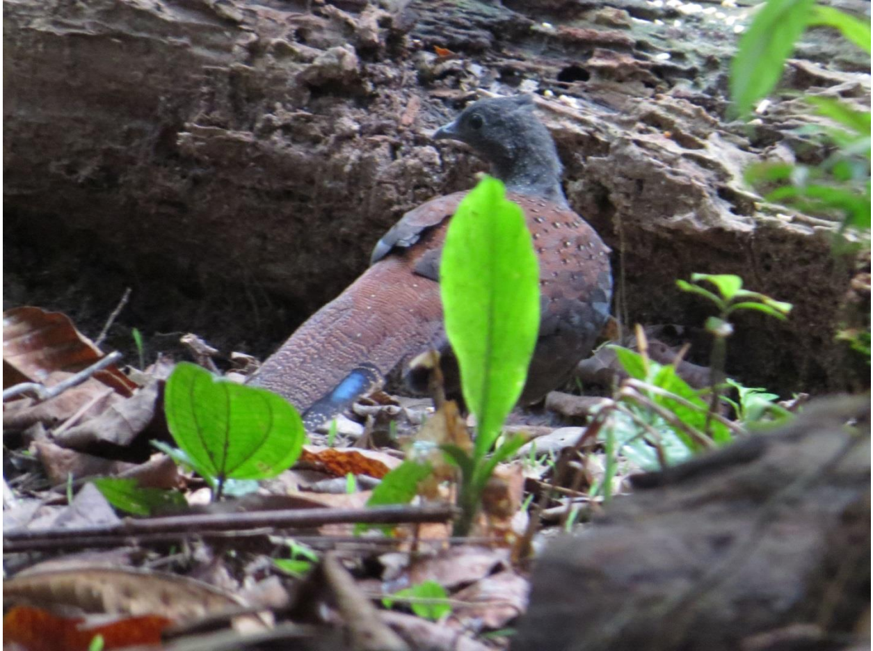
The endemic Mountain Peacock-pheasant at Bukit Tinggi.