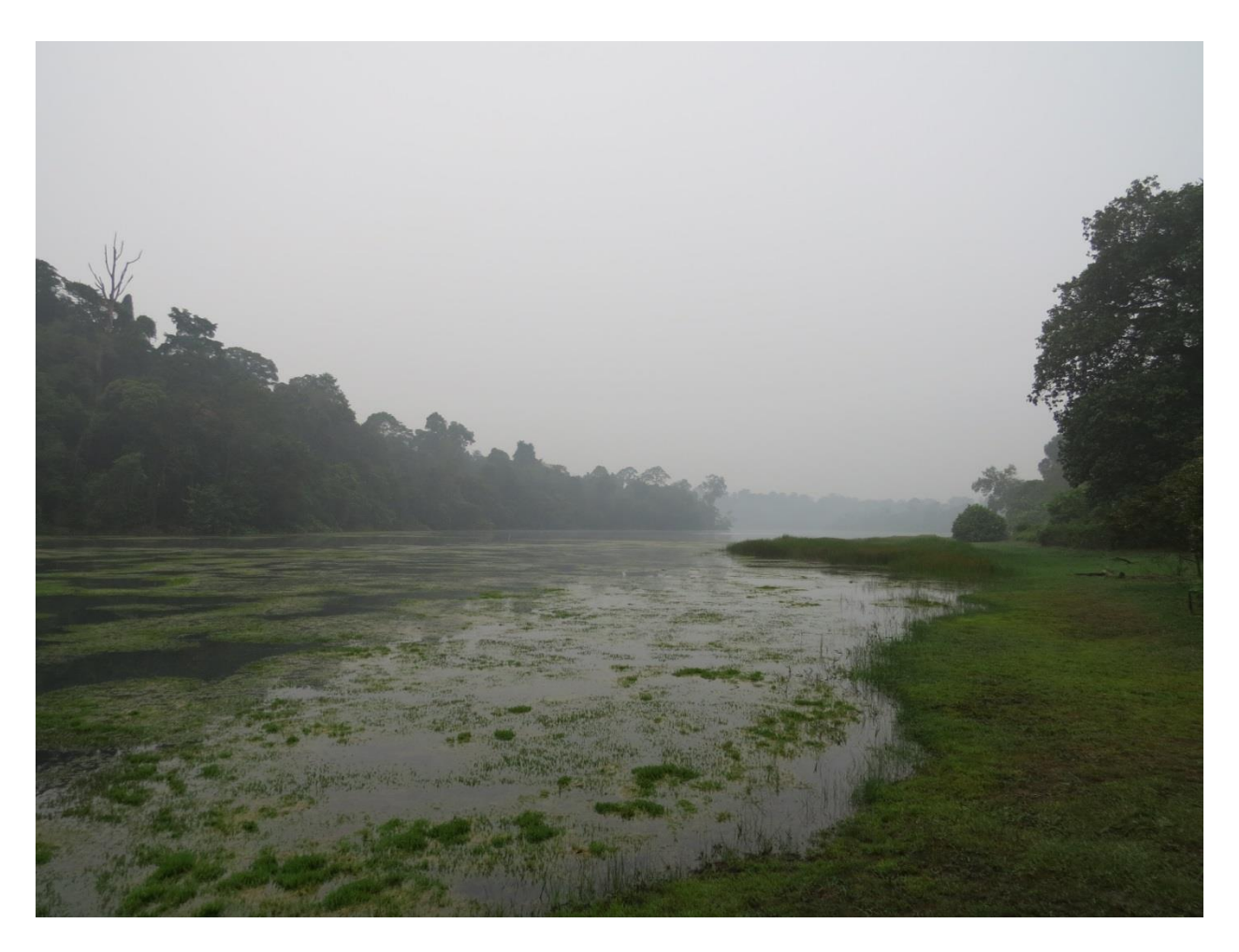
A hazy dawn at MacRitchie Reservoir.