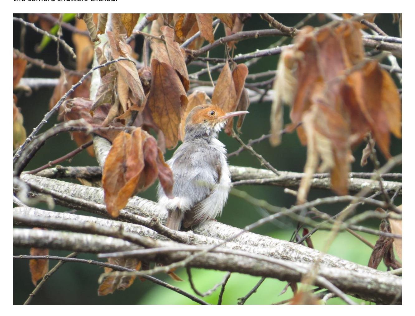
A cooperative Ashy Tailorbird looking very much at home at Sungei Buloh.

On our way back, we stopped by the bridge over Sungei Buloh, and saw our "missing" Common Sandpipers. At the visitor centre, we saw some photographers and chatted a little. They were waiting for a Blue-eared Kingfisher to appear and then an Ashy Tailorbird interrupted us and posed for pictures as the camera shutters clicked.