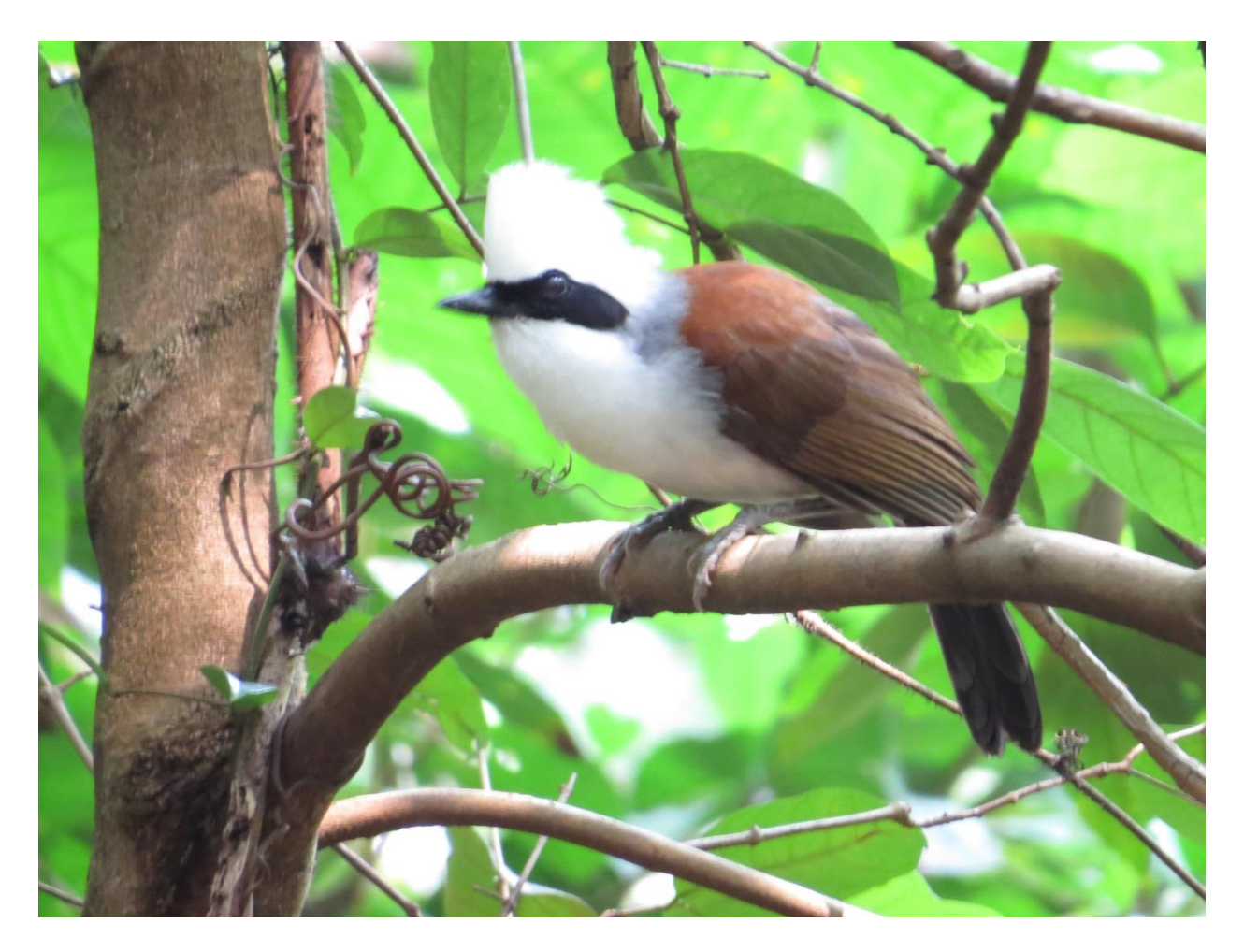
An inquisitive White-crested laughingthrush at Bukit Batok Nature Park.

Simon had an appointment in the evening, so we decided to call it a day there and then. Despite the early end, we had seen 54 species of birds and heard an additional 13 species. We also saw lots of other wildlife and some of the wilder parts of Singapore to make it a wonderful day.