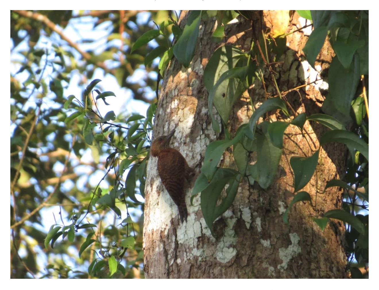
A Rufous Woodpecker foraging at MacRitchie Reservoir.