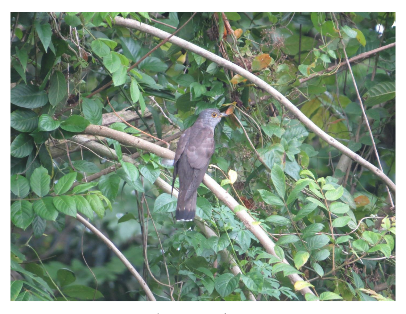
An Indian Cuckoo at Kranji Marshes.