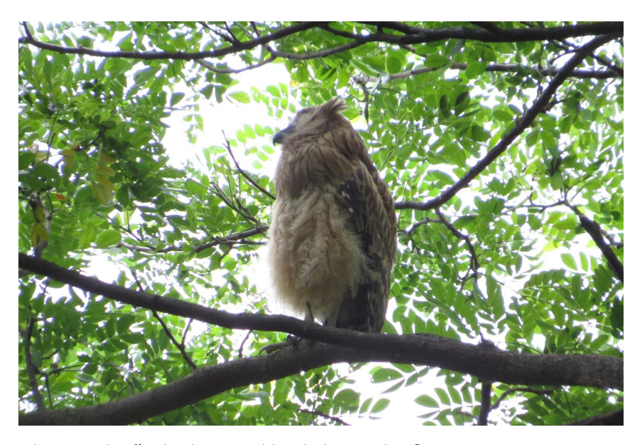
A sleeping juvenile Buffy Fish Owl at Sungei Buloh Wetland Reserve.

As the sun rose, it got hotter and we walked back to the forest. Near the reservoir, we saw a lone Greyheaded Fish Eagle perched in a tree and waiting for its breakfast.