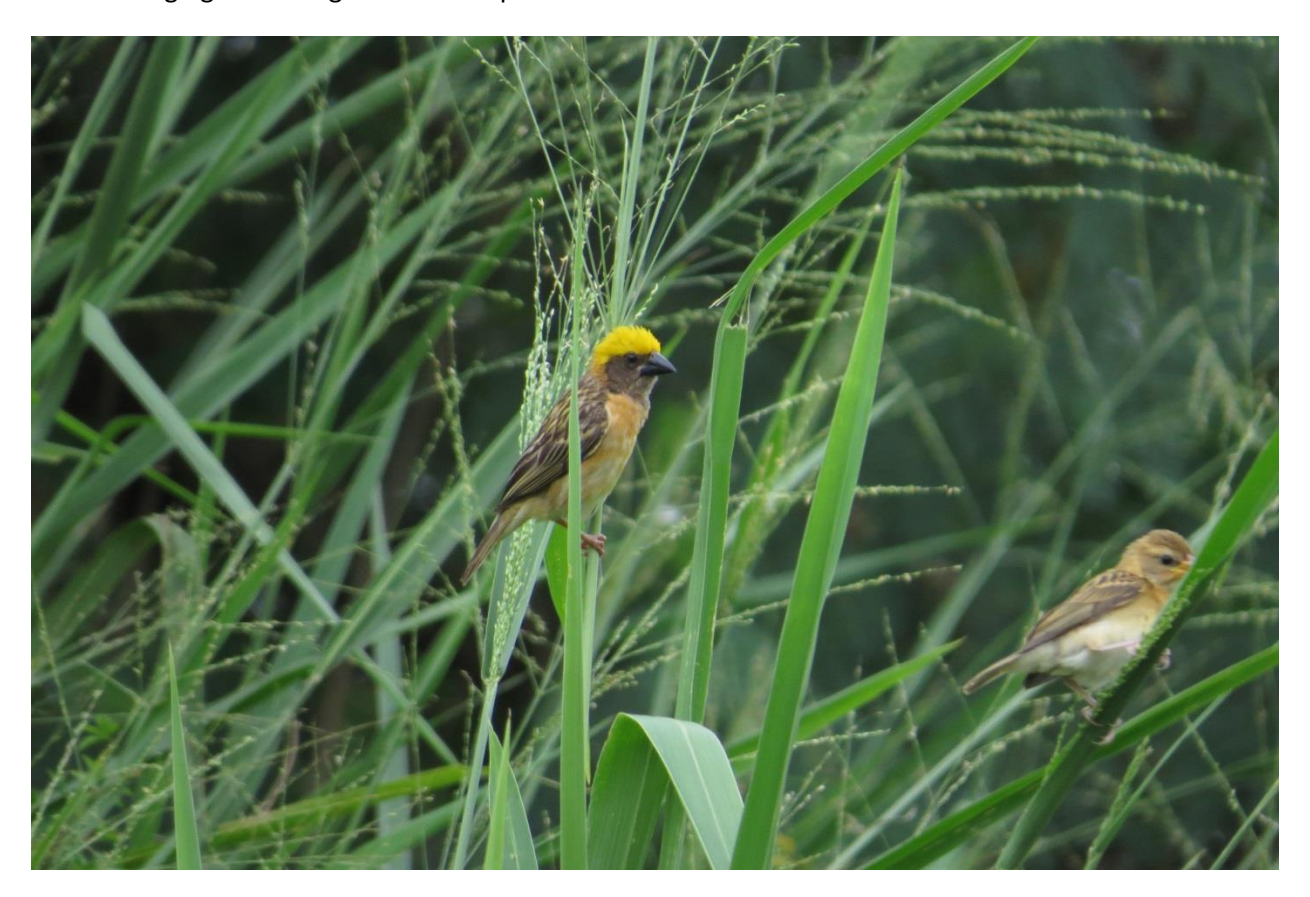
A pair of Baya Weavers in grassland at Lorong Halus.

Overall, it was a great day of birding as we recorded 78 species of birds as well as other interesting wildlife ranging from Long-tailed Macaque to Clouded Monitor.