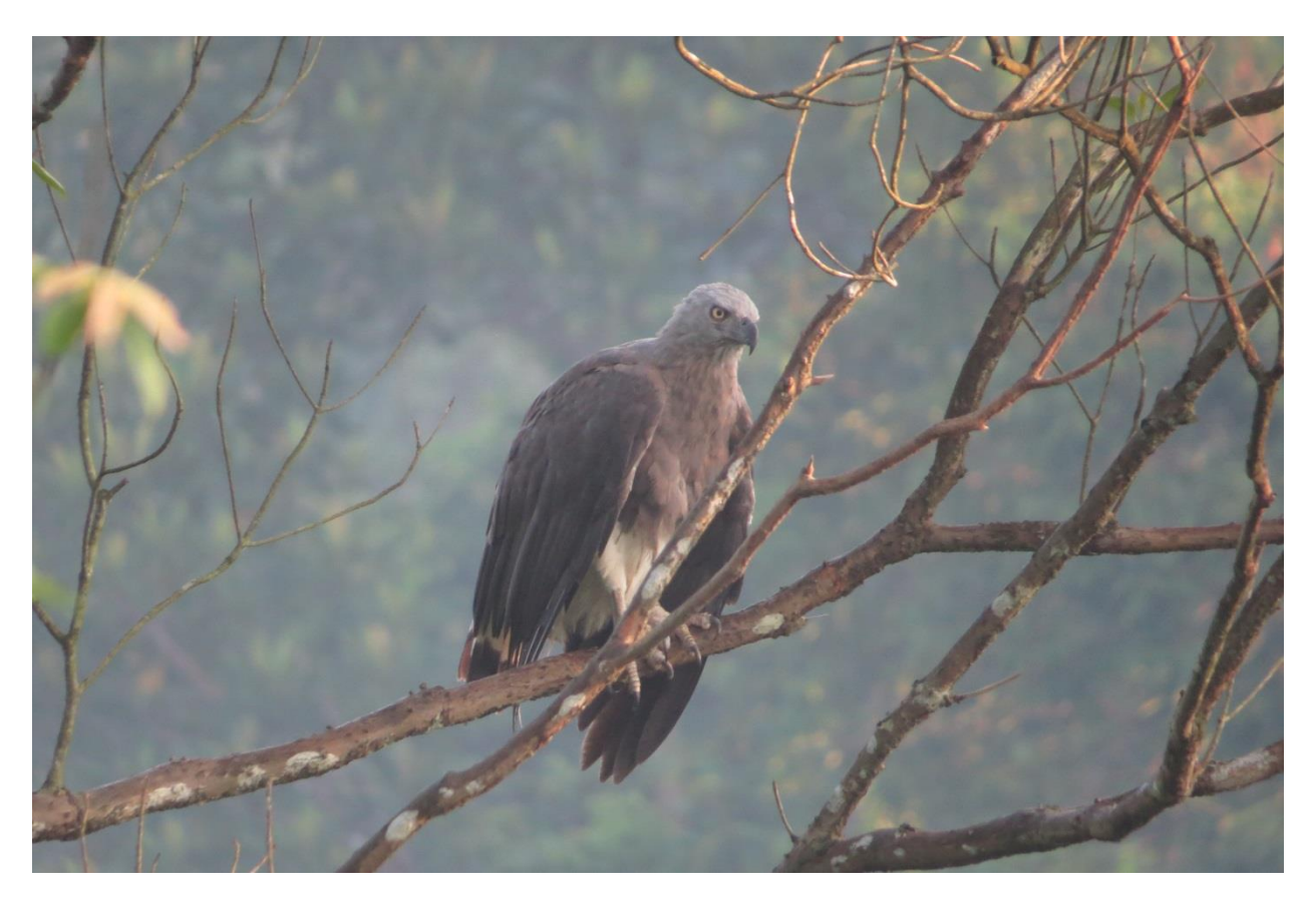
Adult Grey-headed Fish Eagle surveys the water at MacRitchie Reservoir. Photo © Lim Kim Seng

Text & Photos by Lim Kim Seng (<a href="mailto:ibisbill@yahoo.com">ibisbill@yahoo.com</a>)